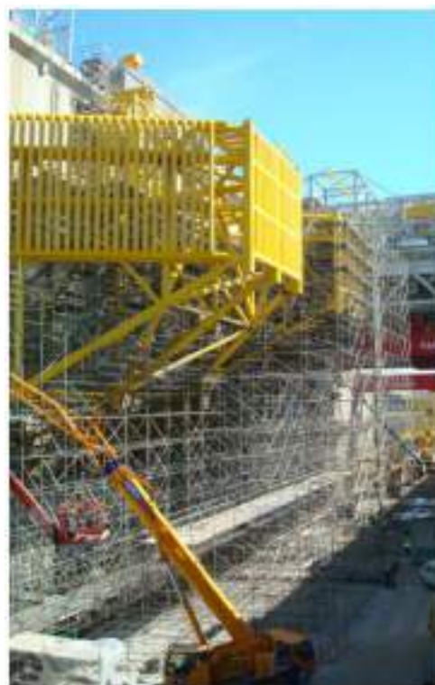
Work: LNG Adriatic