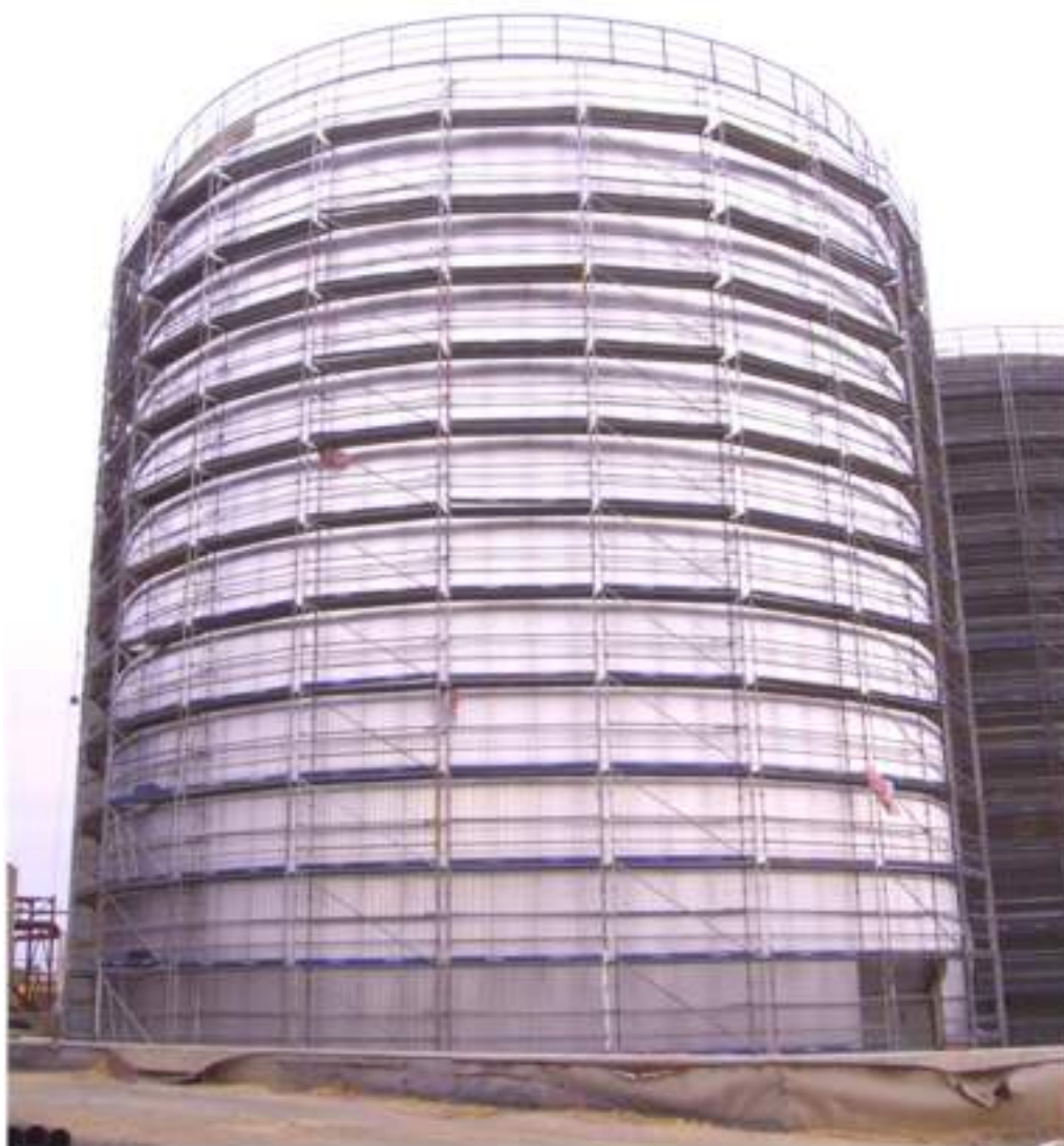
Work: Tank in BioOils plant