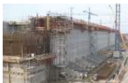
Work: Dyke of Monaco