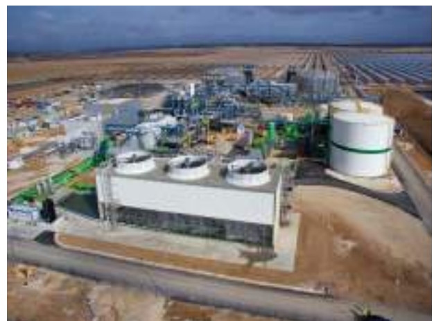
Work: CSP Arenales Morón de la Frontera