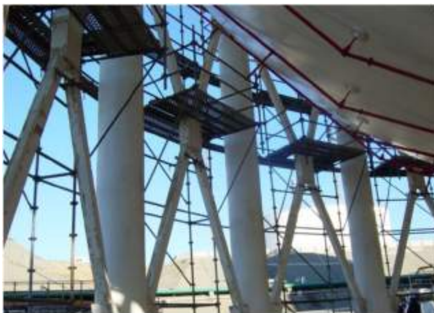
Work: Repsol's spheres