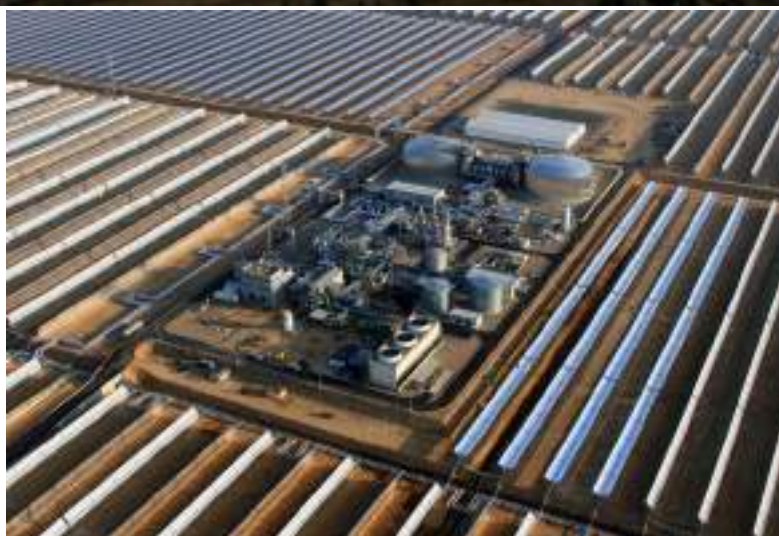
Work: CSP Casablanca