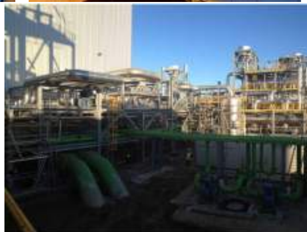
Work: CSP La Africana