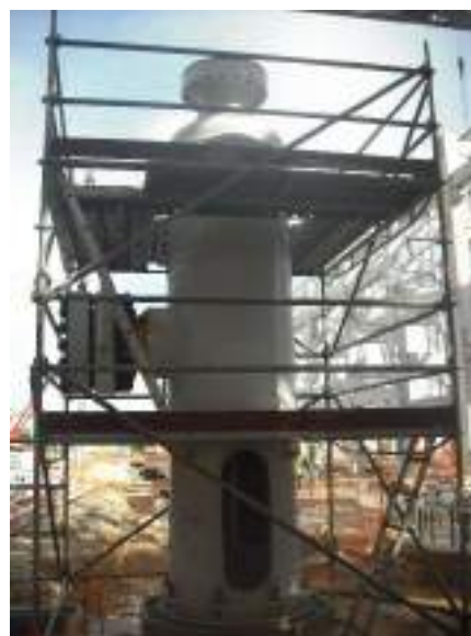
Work: Galp Sines' enlargement