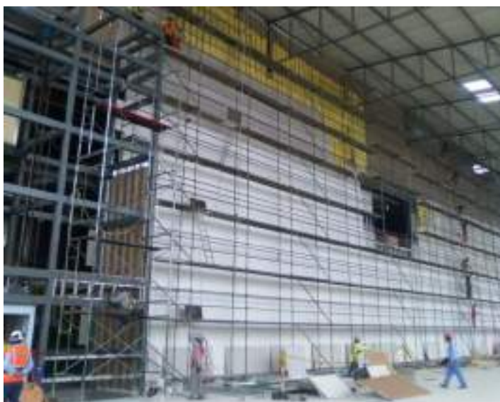
Work: Ajinomoto plant