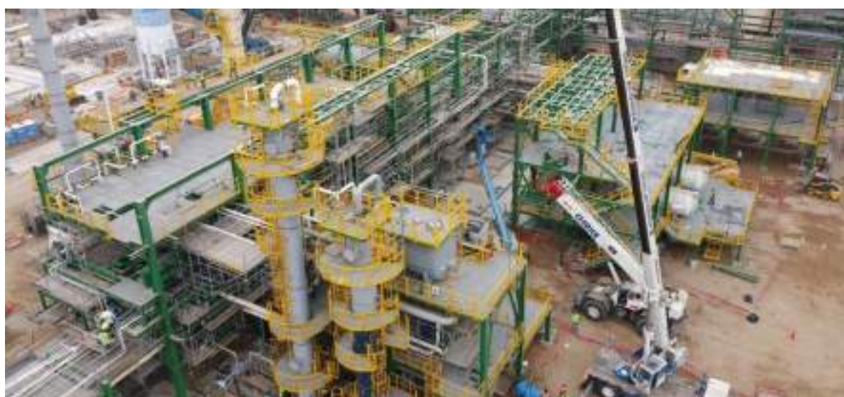
Work: La Pampilla / Unit U53