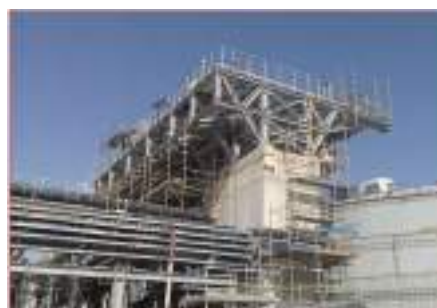
Work: Noor I / Noor II & Noor III