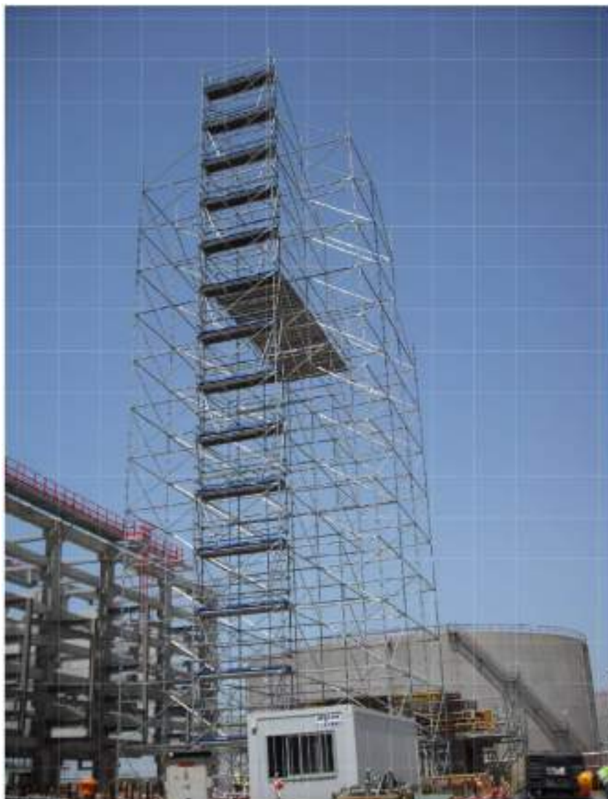
Work: La Rábida